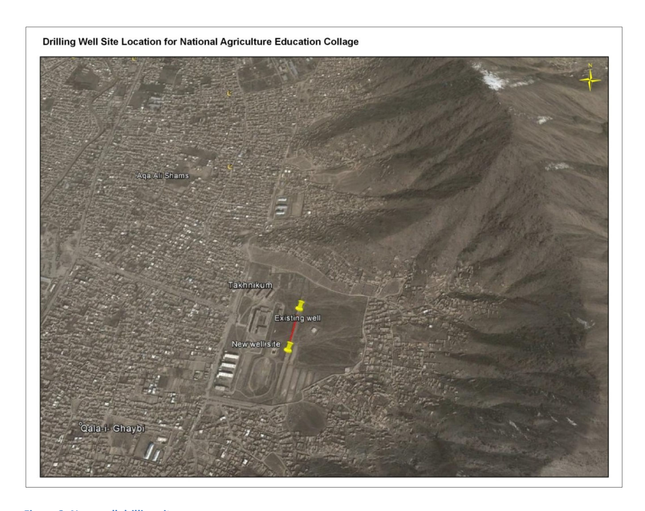
Figure 2 .New well drilling site

It is suggested to drill the well 200m away in south part of existing well. It will produce 1-1.5 L/s, but it is not sustainable for the long time due low recharge and availability of fracture water. The new drilling well site is shown in the Figure 2.