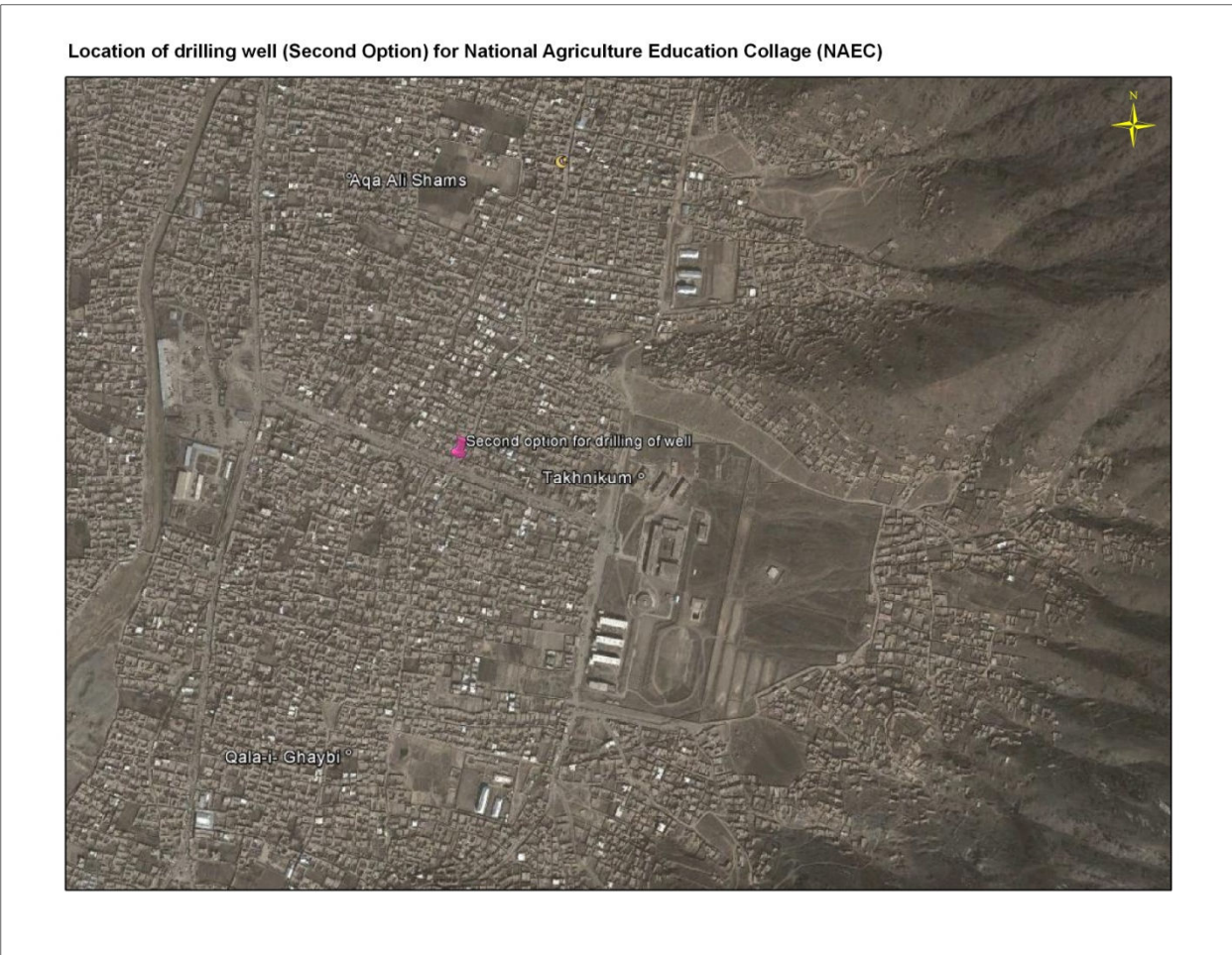
Figure 3. Location of well drilling site