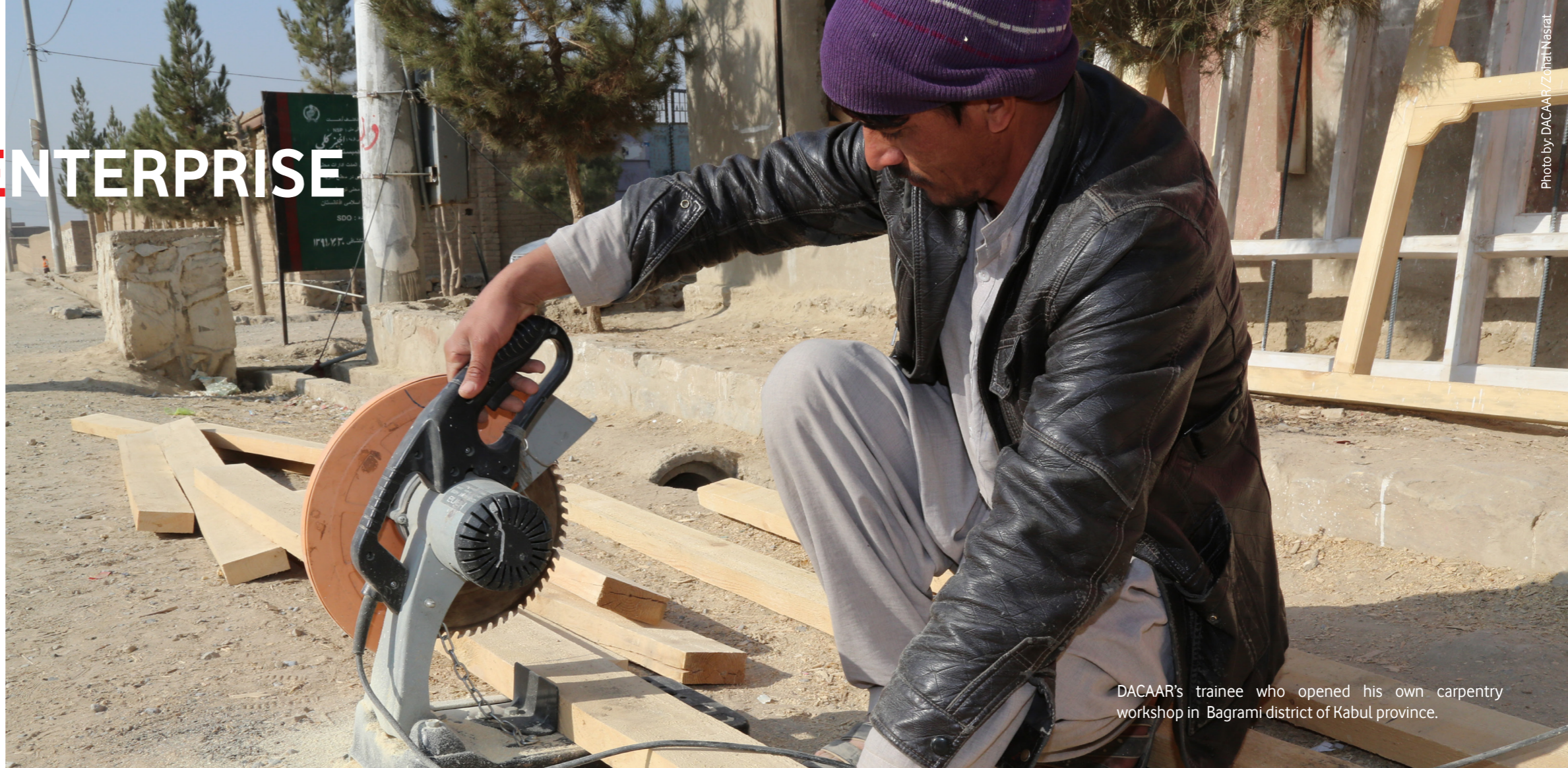
DACAAR's trainee who opened his own carpentry workshop in Bagrami district of Kabul province.

In 2018, one of the major achievements in this programme was the completion of the data base that enables us to follow up on our training participants to see how they benefitted from the vocational training.