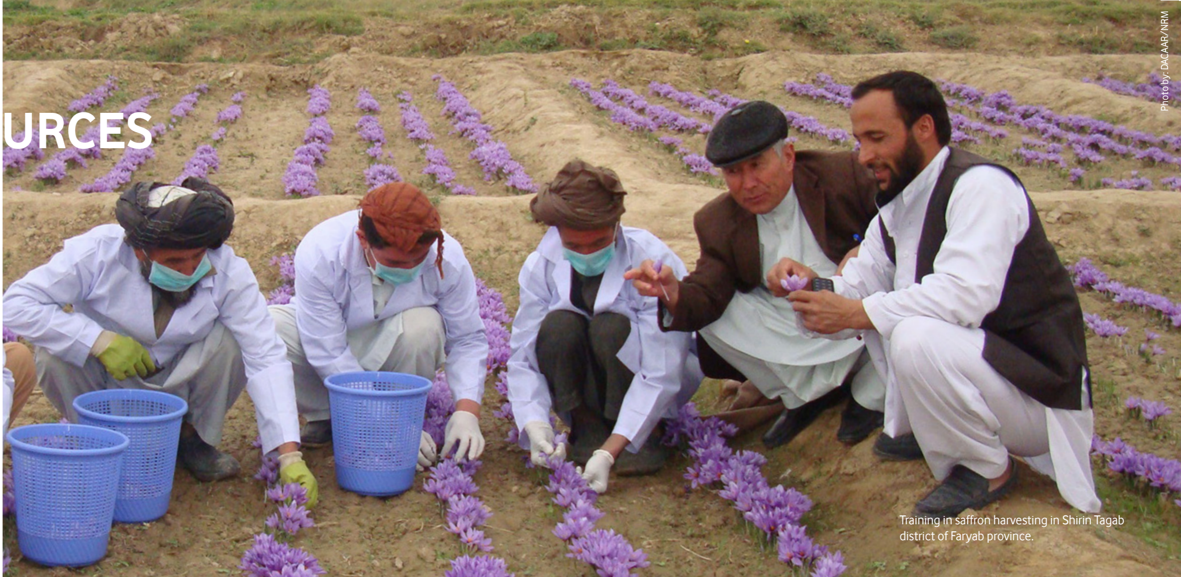
Training in saffron harvesting in Shirin Tagab district of Faryab province.