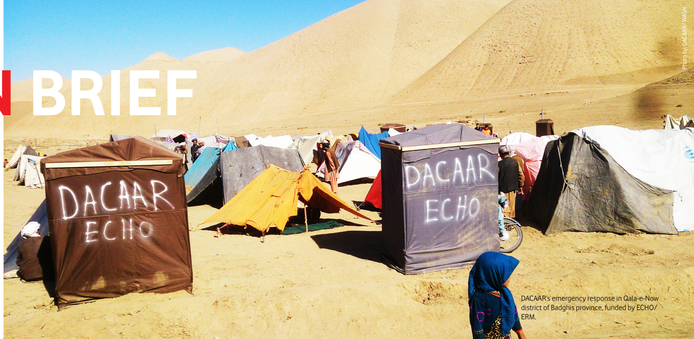
DACAAR's emergency response in Qala-e-Now district of Badghis province, funded by ECHO/ERM.

In 2018, DACAAR assisted almost a million beneficiaries. This is a significant increase compared to 2017 where the number was 659,602. Helping the drought victims and addressing other emergencies are the main reasons for the increase.