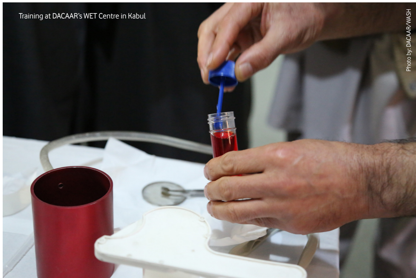
Training at DACAAR's WET Centre in Kabul

An engineer working for Agha Khan Foundation in Baghlan province, attended the solar powered water supply network training workshop at DACAAR.