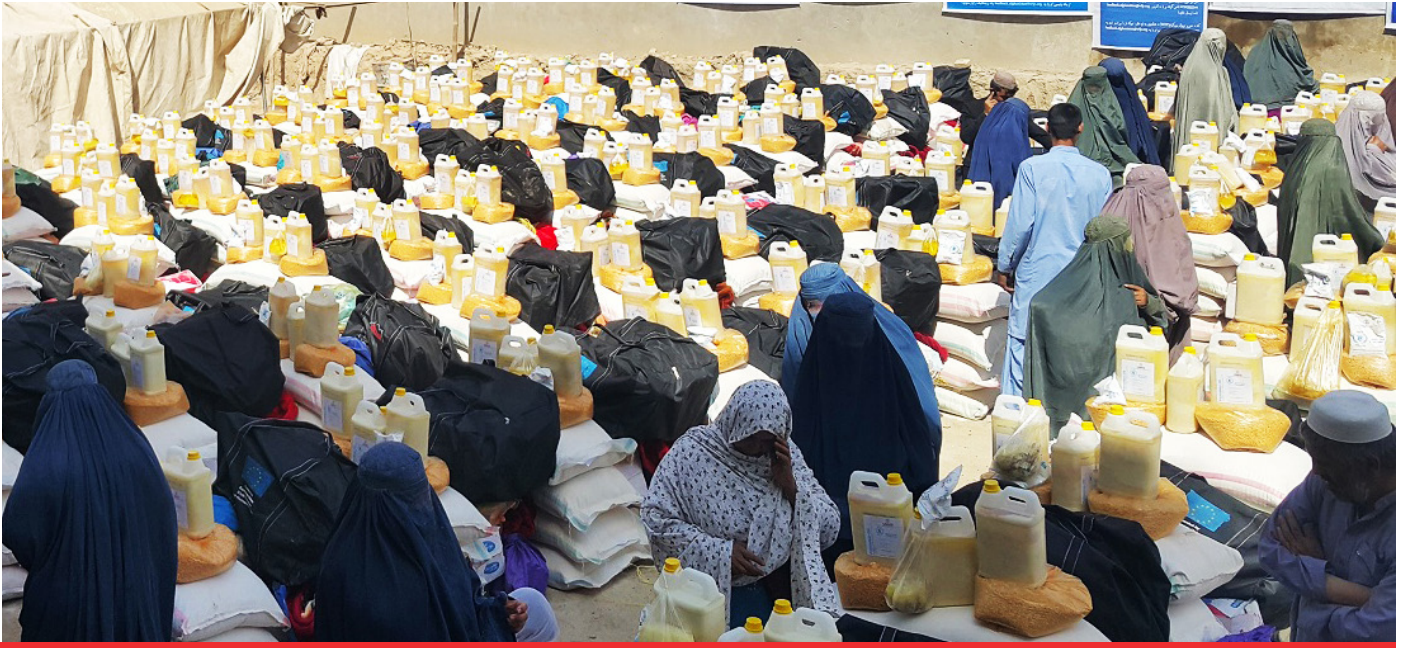
Hygiene kit distribution site, Kandahar province.