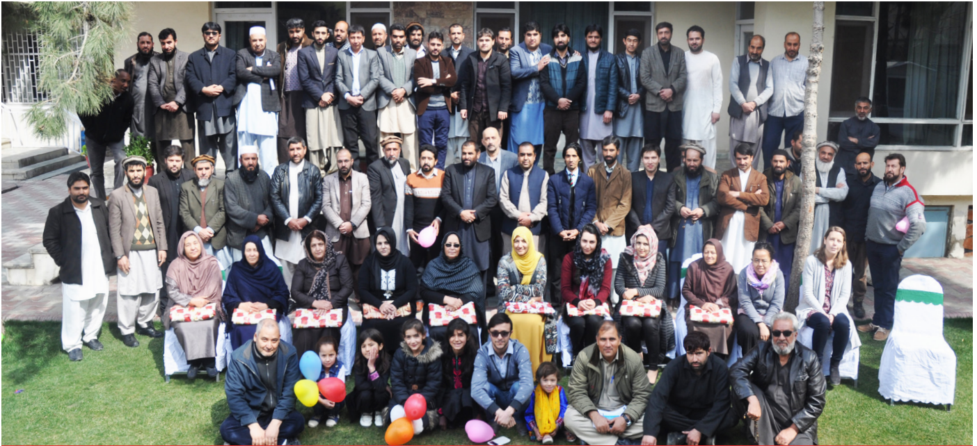
DACAAR staff celebrate Women's Day on 8th of March, DACAAR main office, Kabul Province.