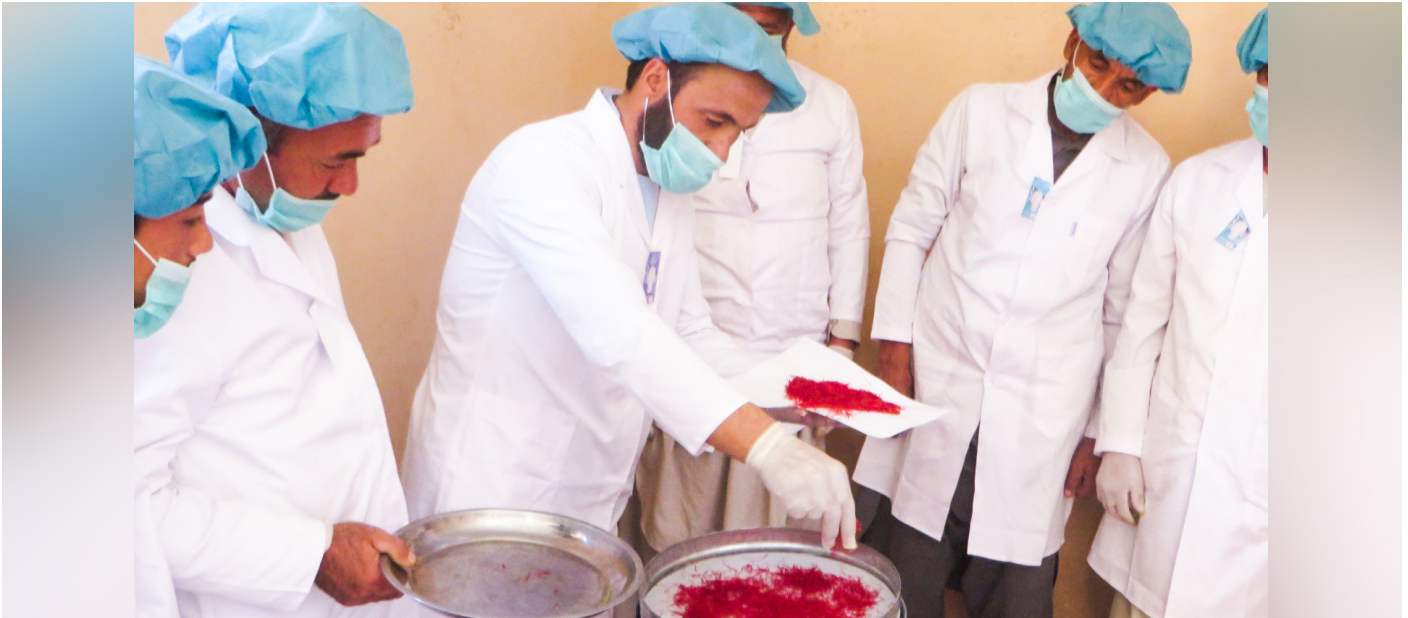
DACAAR staff illustrates Saffron processing to a group of farmers, Dawlat Abad district, Faryab province.