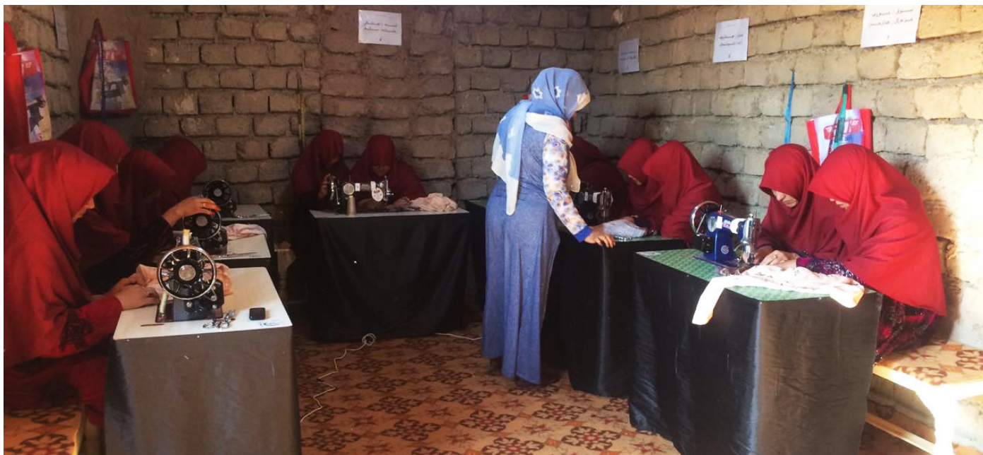
Women receive vocational skills training (tailoring), Injil district, Herat province.