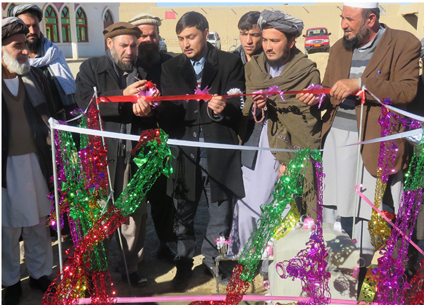
Inauguration of rehabilitated Rubatak gravity fed pipe scheme network, Samangan province.