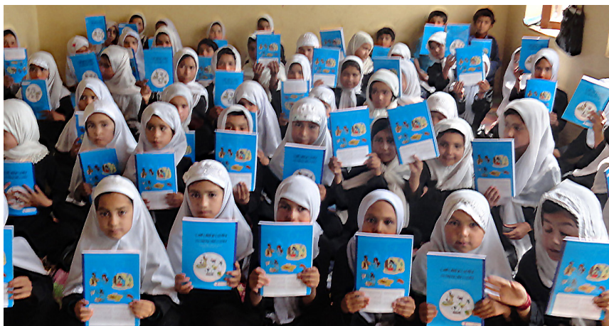
Notebooks printed with hygiene messages distributed to school girls, Dihdadi district, Balkh province.