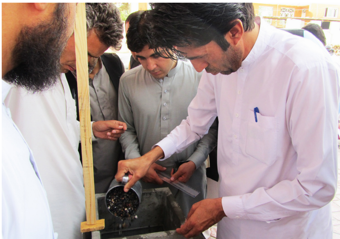
Practical training on Bio-sand filter construction, Kabul.

Based on the result of the 2016 Key Performance Indicator (KPI) annual survey conducted in 2017, client organisations of the WET Centre, have reported that implementing WASH projects have benefitted 1,316,419 people. 793,566 people got access to safe water and 522,853 people received better sanitation. This illustrates the multiplier effect of the DACAAR Centre's support to different clients. ( http://www.cawst.org/about-us/results ).