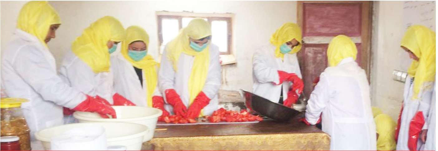
Women food processing training (making tomato paste), Injil district, Herat province.