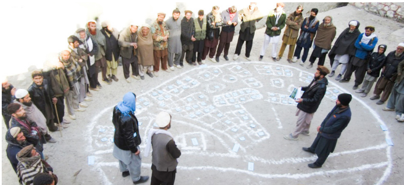
Developing Community Resource Map, Noorgram district, Nooristan province.