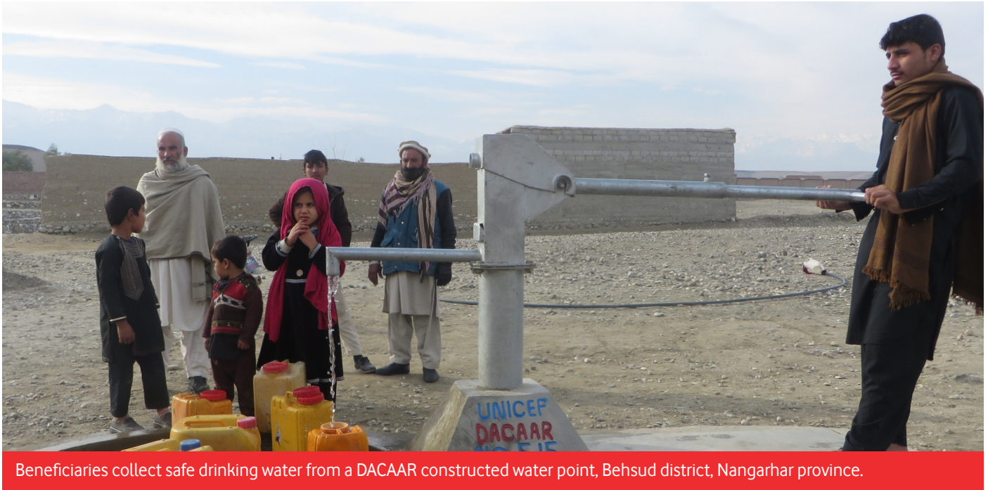
Beneficiaries collect safe drinking water from a DACAAR constructed water point, Behsud district, Nangarhar province.