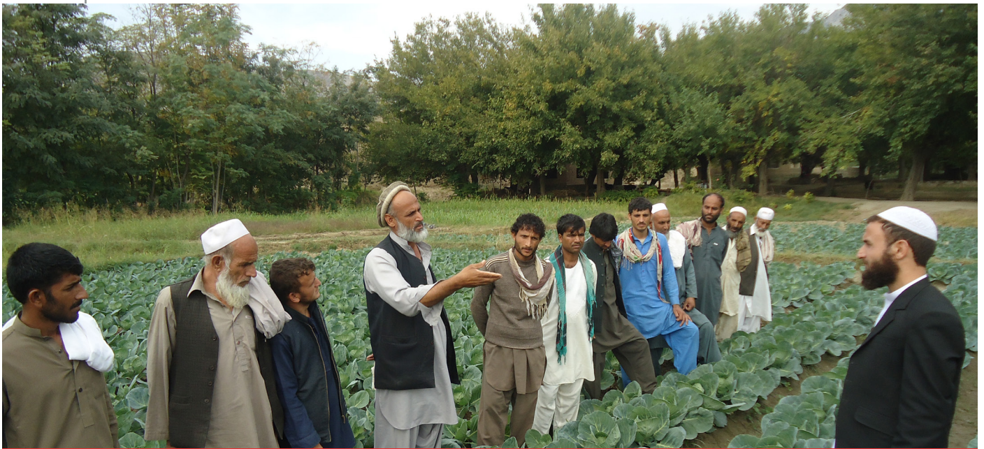
Vegetable Farmer Field School (FFS), Qarghanee district, Laghman province.