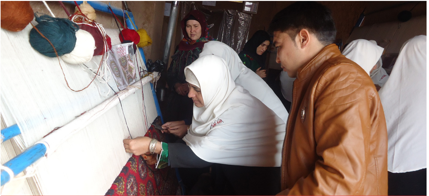
DACAAR staff teaches carpet weaving to female trainees, Herat City, Herat province.